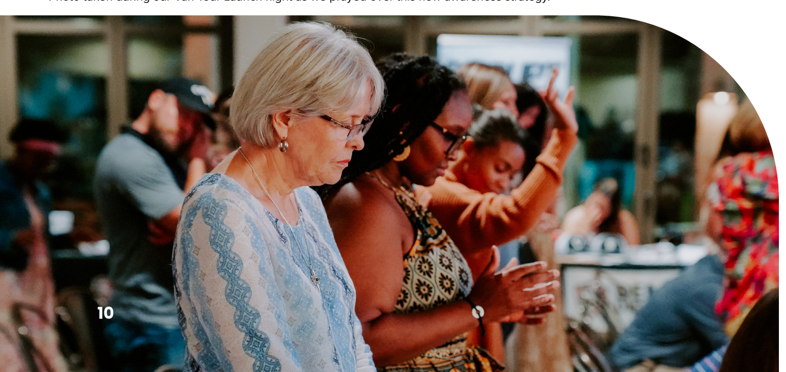
Photo taken during our Van Tour Launch night as we prayed over this new awareness strategy.