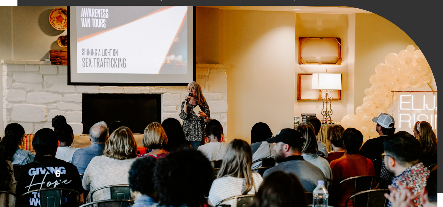
Photo from our Van Tour Launch Night where we introduced the new video component of Van Tours.

PEOPLE DOWNLOADED THE ELIJAH RISING PODCAST