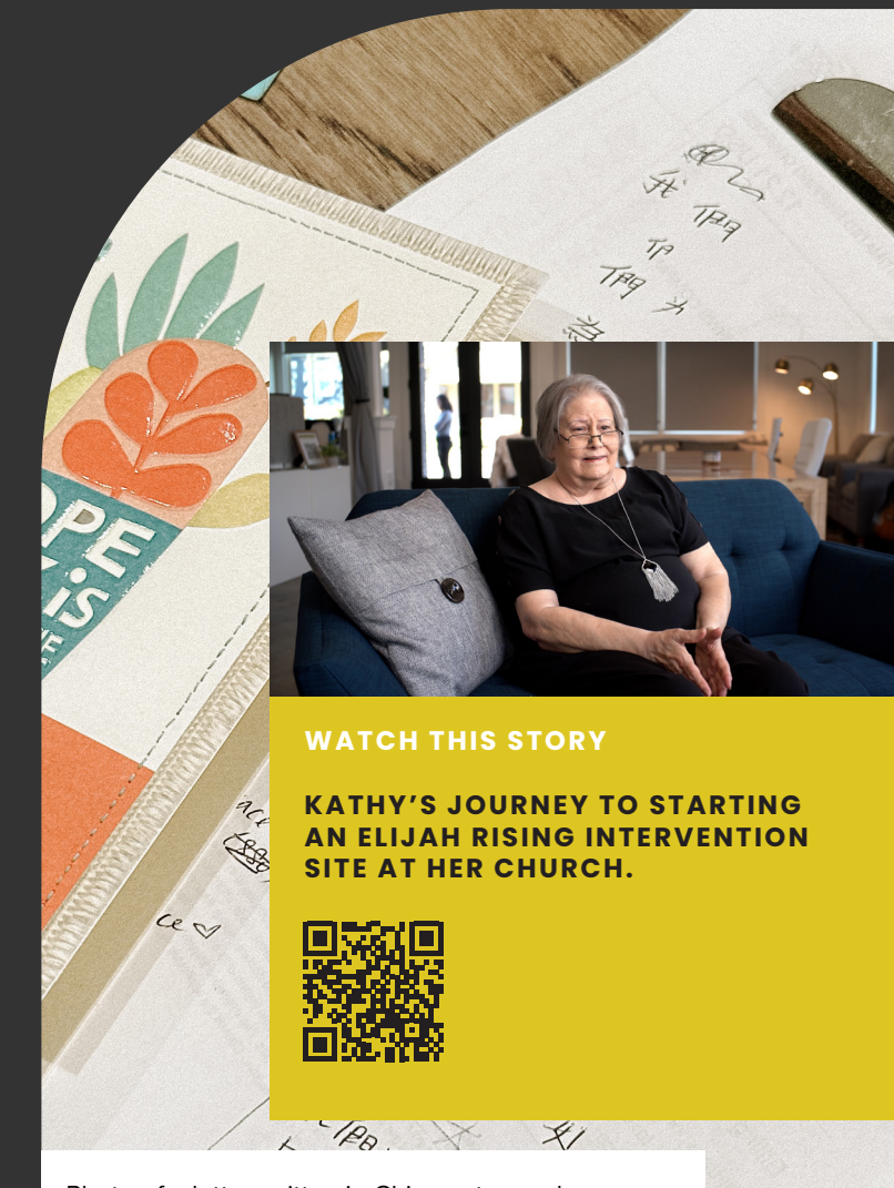
Photo of a letter written in Chinese to reach women in the illicit massage parlors.

* Elijah Rising partners with other agencies and private recovery services to facilitate the majority of exits for survivors. The number of which are not included in this total.